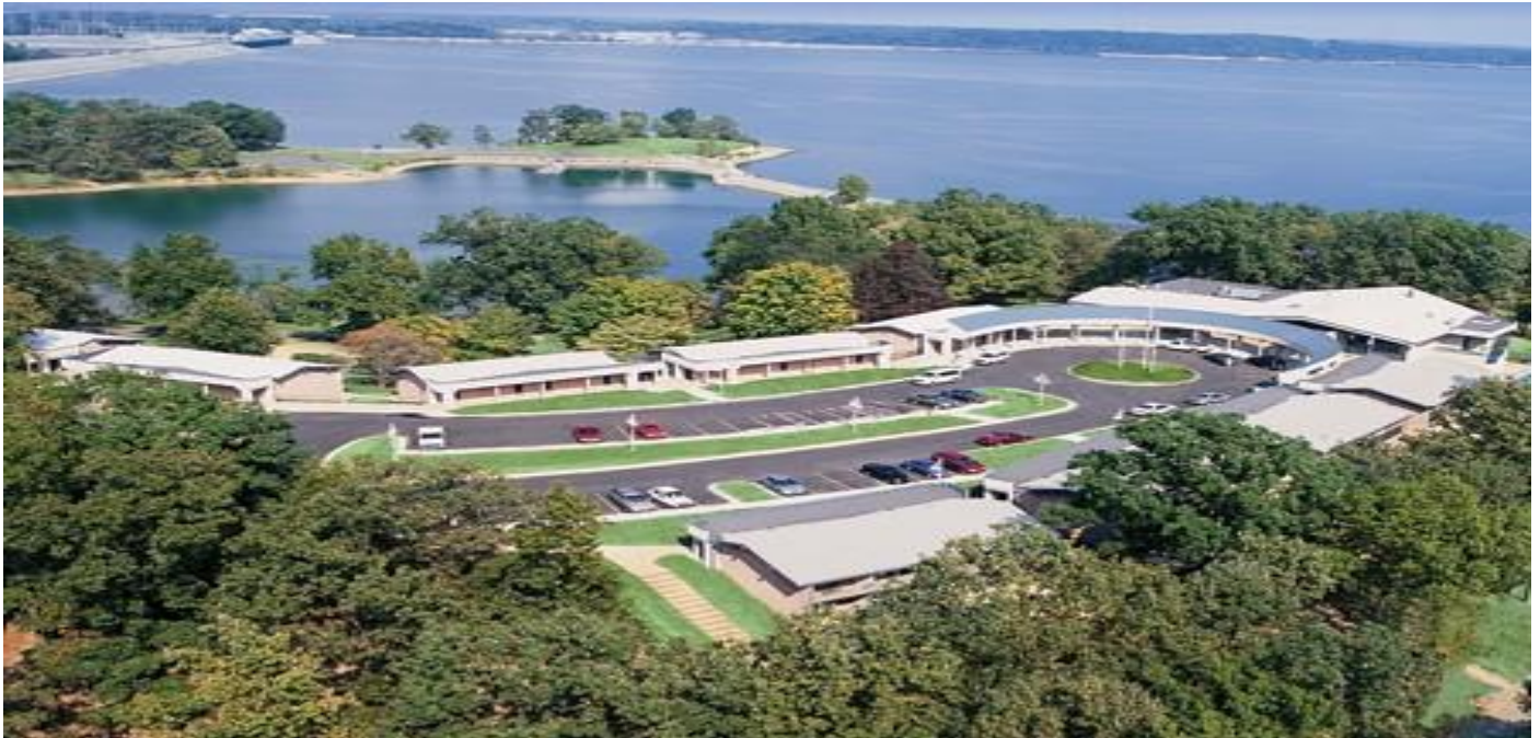
KENTUCKY DAM VILLAGE, GILBERTSVILLE, KENTUCKY April 19th thru April 22nd