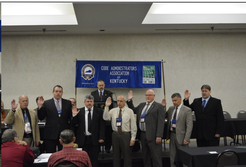
Above/center-newly elected 2015 Officers and Board of Directors.