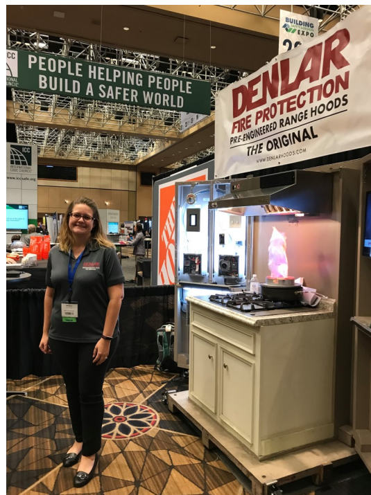
CAAK sponsors Fall Conference @ ICC 2019 in Las Vegas Nevada DENLAR Fire Protection -