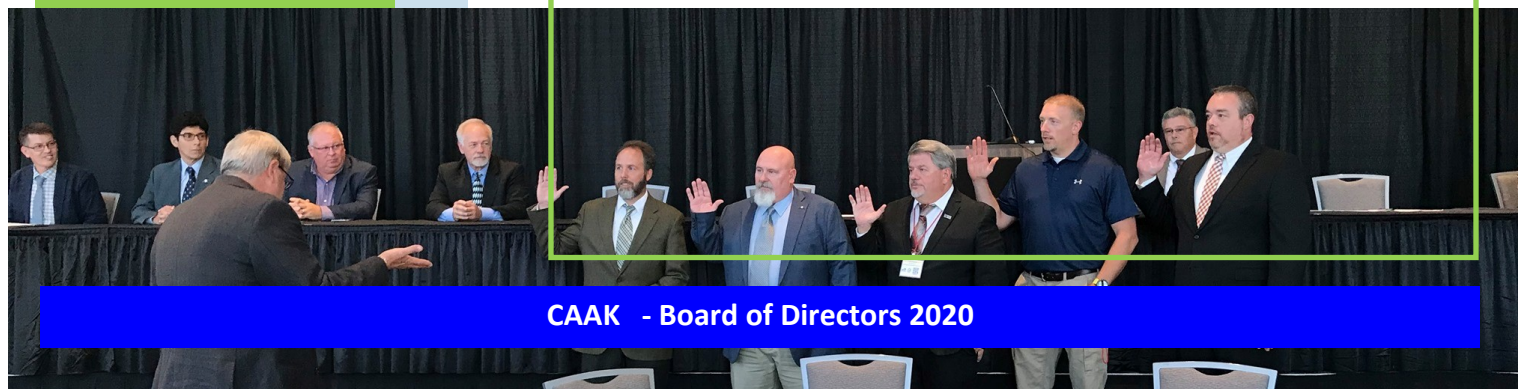
CAAK - Board of Directors 2020